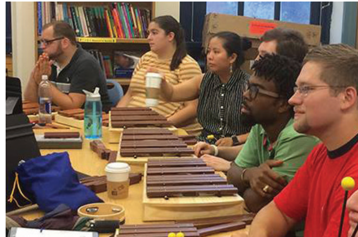
ETM teachers participate in Orff-Schulwerk certification.