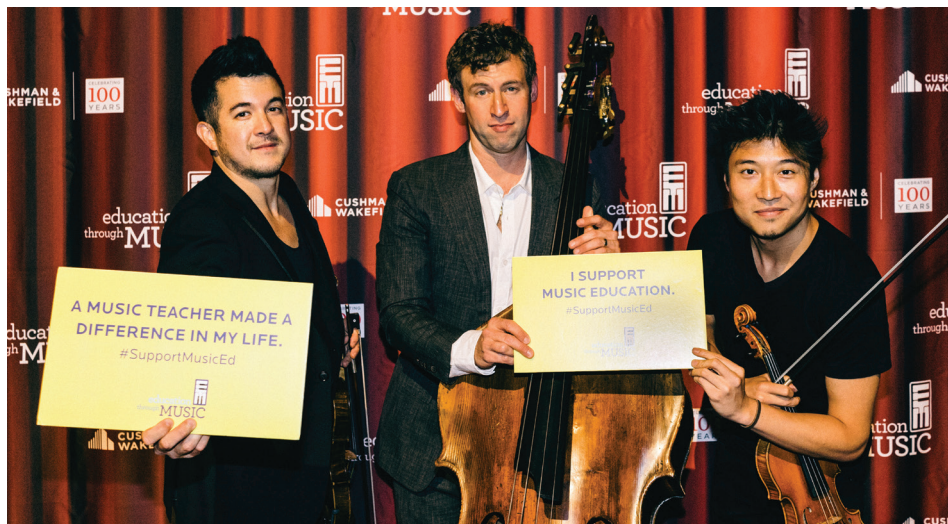
String trio Time For Three