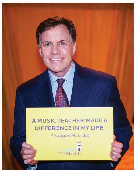
Sportscaster Bob Costas