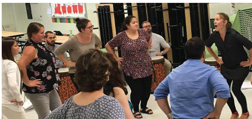
Music teachers learn new ways to engage students during ETM Academy.

ETM Academy teachers took a break from the classroom and spent a day in Coney Island, where they were treated to a delicious lunch at Coney Island's famous Gargiulo's restaurant. New and returning teachers came together to explore ETM's resources collaboratively for practical application in the classroom. After the working lunch, teachers were given admission wristbands to enjoy the rest of the day at Coney Island's Luna Park. 🎢