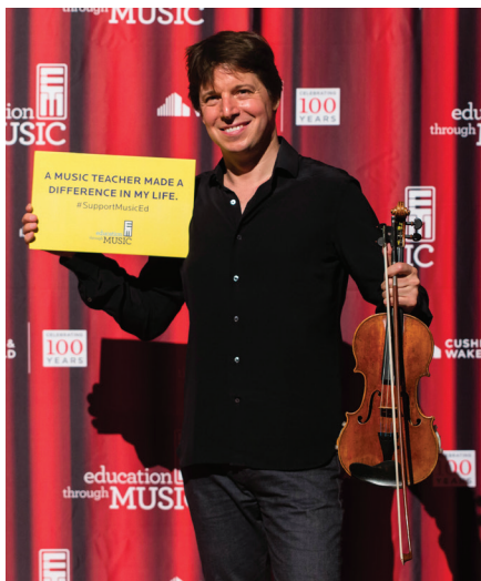
Grammy Award-winning violinist and ETM Board Member Joshua Bell