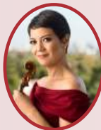
ANNE AKIKO MEYERS